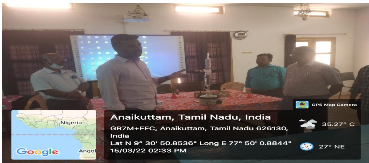
Some snaps during Programme